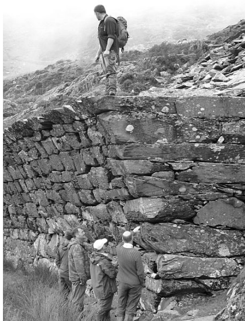
Right Ceri and Sean at RWS (report below)

The photo (left) shows Craig atop Gorseddau's amazing overhanging 'wailing wall', whilst the other participants take a close look at the stonework.